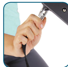
Figure 8 Labeled ② Set Angle right on the equipment!