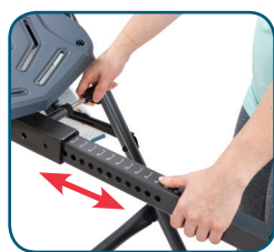
Figure 7 Labeled ① Set Height right on the equipment!