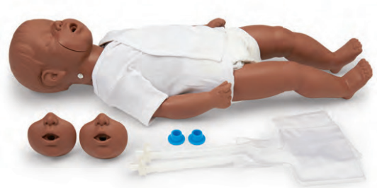
The Pediatric CPR Manikins come fully assembled and ready to use.