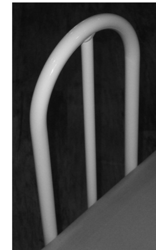
The mattress should rest against the handle of the bed grab rail when fitted

and the product; on most slatted style beds a good quality mattress rests securely within the bed base. If sideways movement of the mattress does appear evident this should be discussed with your Healthcare Professional or contact us for further advice. The position of the mattress should be visually checked and appropriately maintained, for example after making the bed/changing sheets etc.