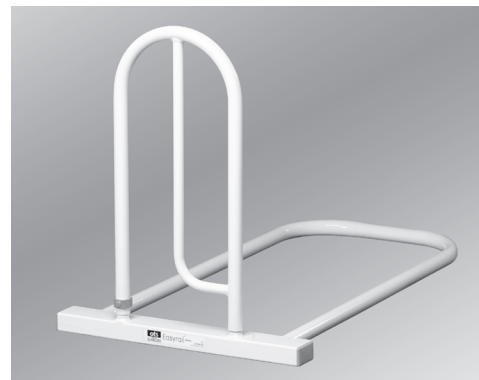
Easyrail® Single Handle

RAIL450: Easyrail® Bed Grab Rail, Twin Handle, White.