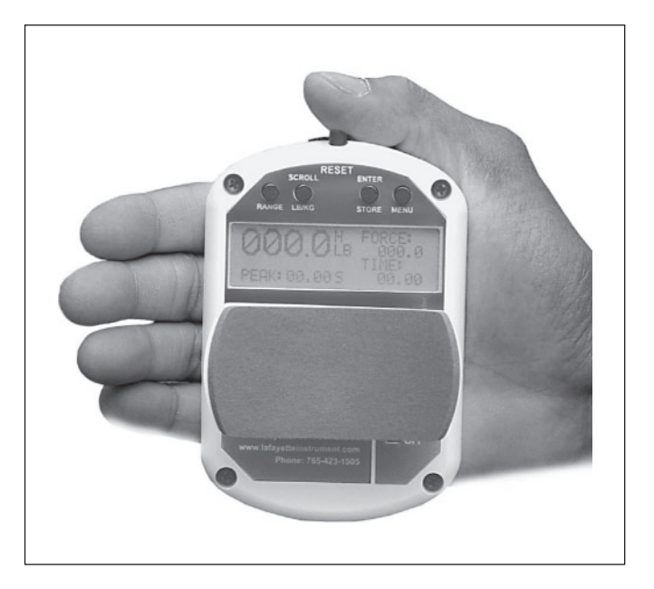
Fig. 2. Hand-held dynamometer.

The peaks of the Biodex and the HHD readings from the two attempts were used for the analysis. The agreement between the Biodex and the HHD was assessed using Pearson correlations and a Bland-Altman analysis [21]. The HHD and Biodex peak readings were categorized into tertiles of strength. A Kappa coefficient was then used to assess the agreement between the tertiles.