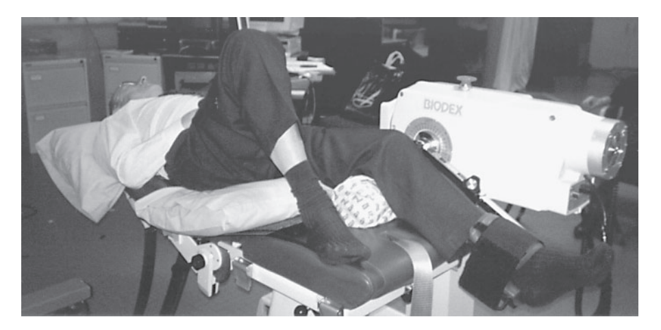
Fig. 1. Biodex dynamometer and study participant positioning for Biodex and HHD measurements.

the ankle of the non-dominant leg proximal to the medial malleolus. On the examiner's instruction, the participants were asked to push maximally against the pad, trying to straighten their leg from the knee. One practice go was performed and discarded, followed by two further attempts which were recorded. The peak torque of each of the two attempts was recorded in newton metres (Nm).